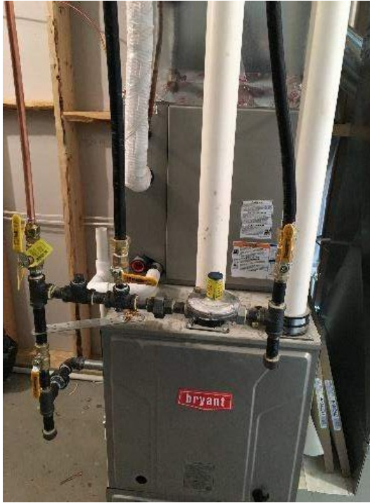
Furnace front and gas piping