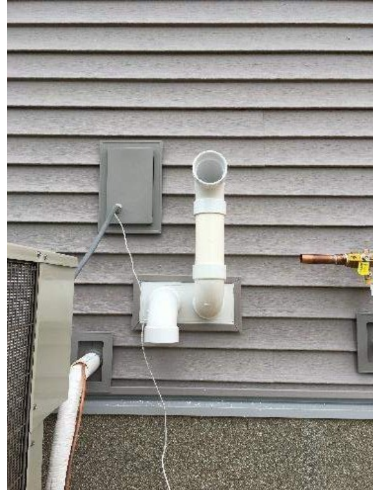
Furnace exterior venting