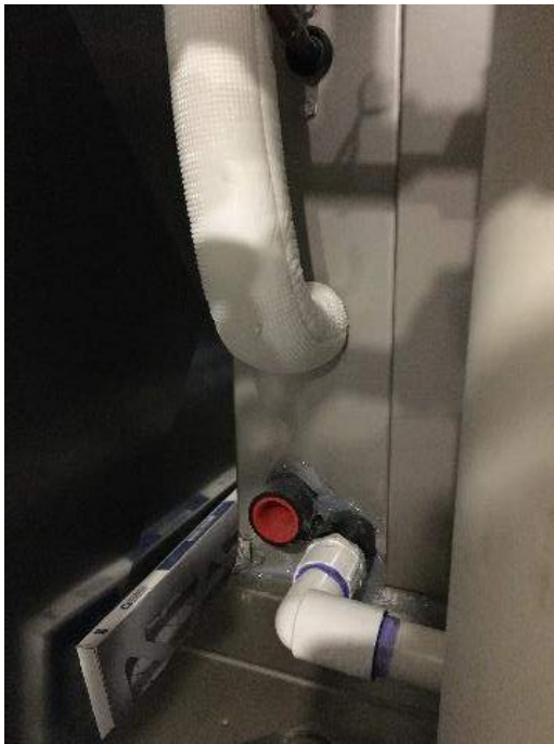
AC connection at furnace