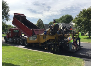
Installation of new asphalt surface