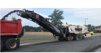
Removal of the existing street surface by milling

In the months/years following installation of the new asphalt surface cracks will appear. The formation of these cracks are a reflection of the cracks in the underlying asphalt layer. Cracking in the new asphalt surface is a normal occurrence and does not mean the street is damaged or defective in any way.