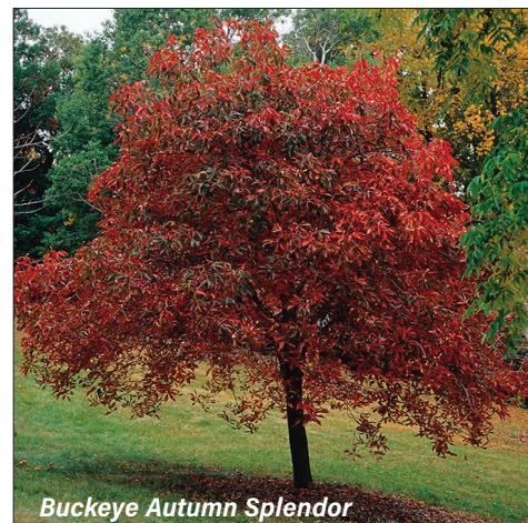
Buckeye Autumn Splendor

Small accent tree with rounded shape. Add color to your landscape with yellowish-green flowers in spring and brilliant fall color. Spiny seeds may require occasional cleanup. Full sun to partial shade.